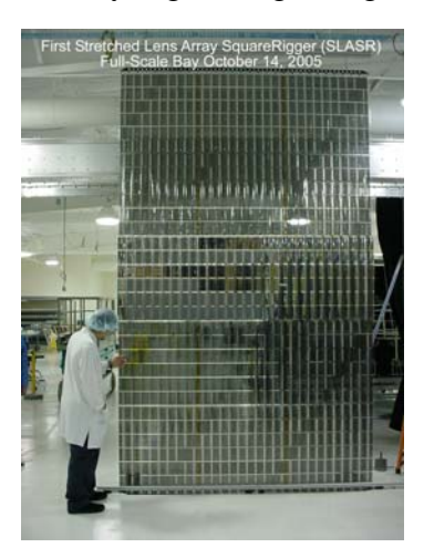
Figure 1: Full scale SLASR module

In this study, we will use the Stretched Lens Array on the SquareRigger platform as the basis (SLASR). At the present time this design has the following characteristics: specific power – 300 W/kg, areal power density – 300 W/m<sup>2</sup>, stowed power – 80 kW/m<sup>3</sup> and capable of high voltage (>600 V) operation. Figure 1 shows a 2.5 x 5 m full scale building block module of the SLASR. This module is sized to produce 3.75 kW and weighs only about 10 kg.